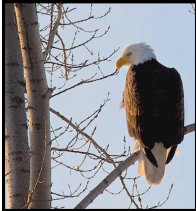
Majestic Bald Eagle