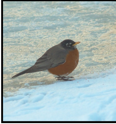
Robin Anxious for Spring