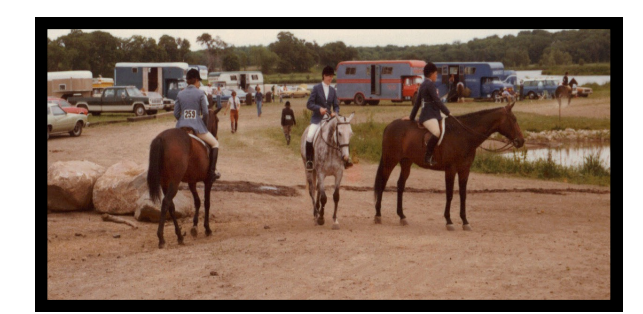
Neill Lake horse tracks