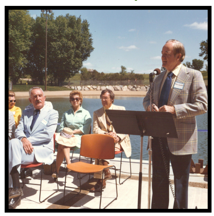
Hubert Humphrey at Pool Dedication