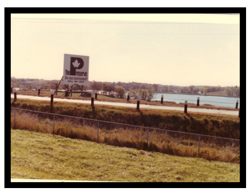
Anderson Lakes Parkway