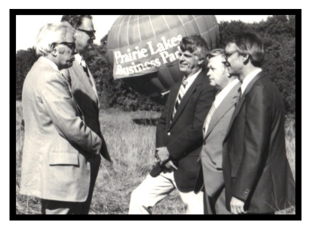
Preserve Hot Air Balloon Races