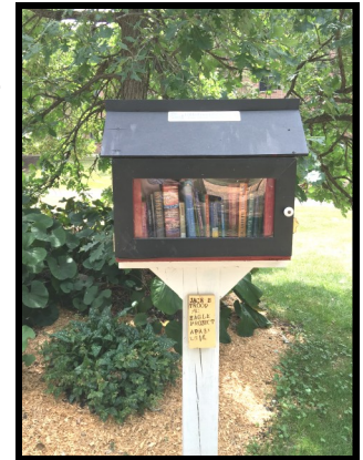
Eagle Scout Project

How it works: The libraries belong to everyone. Anyone may use them. They offer a way to share good things to read.