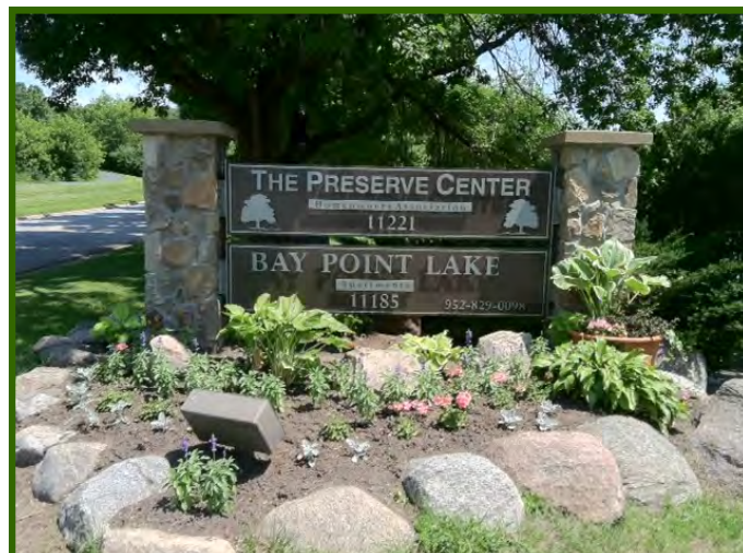
Your New Preserve Center Sign!

We have two buckthorn pullers available for loan to residents at the Preserve office. Call for availability.