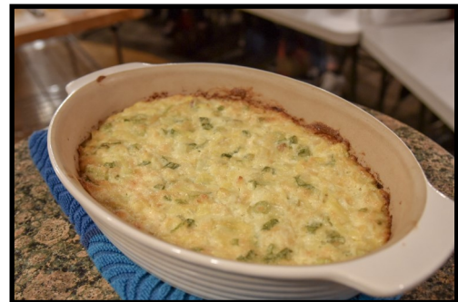
Artichoke & Parmesan Spread