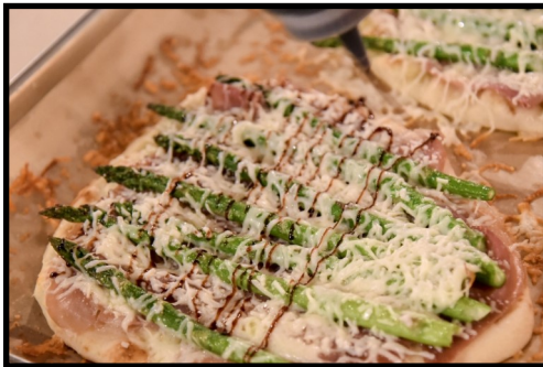
Prosciutto, Asparagus & Asiago Flatbread