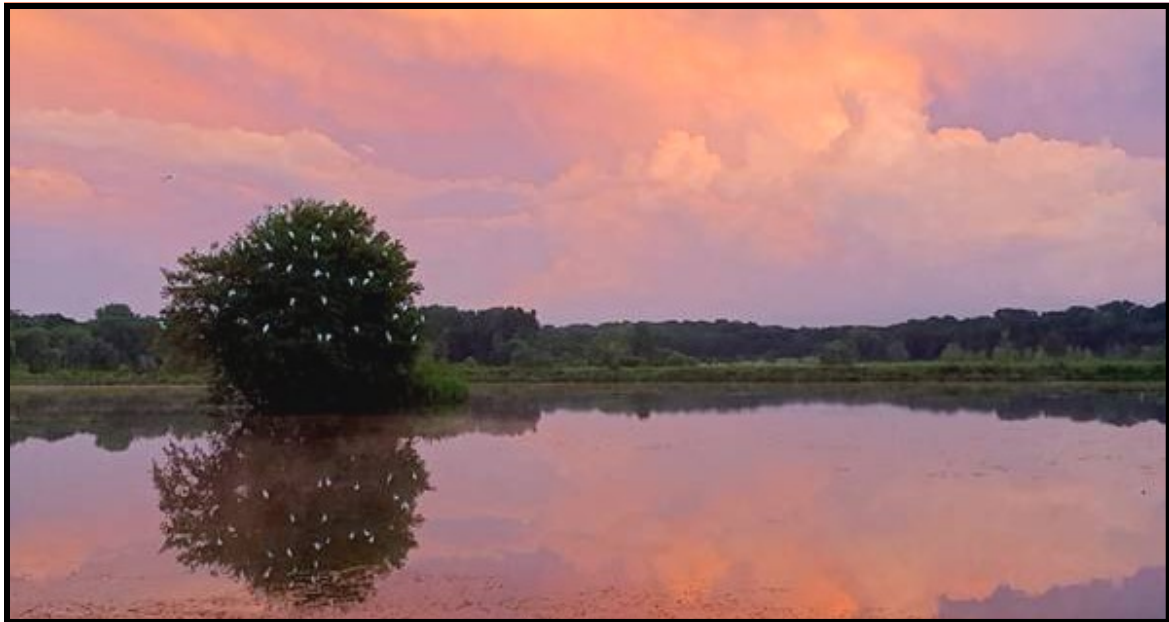
We have note cards for sale in the office with beautiful photos of wildlife from the Preserve !