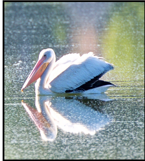
In the Preserve at Neill Lake